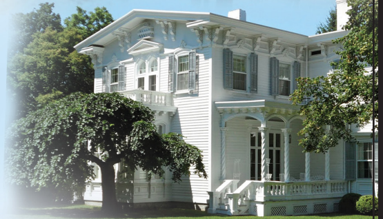
SAG HARBOR WHALING MUSEUM